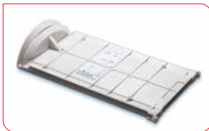
The high-quality folding mechanism guarantees a long service life.

The seca 417 stadiometer is ideal for mobile use. During regularly scheduled examinations, medical personnel check the nutritional condition and development of infants and toddlers. The process should go quickly, so it's important to be able to read results easily. The red markings and high-quality printing of the scale don't fade even after years of intense use.