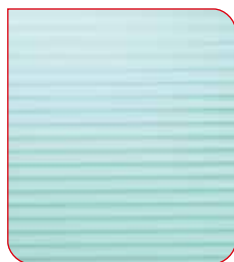
Non-slip groove structure on the glass plate.

It is possible to slip off glass, particularly with wet feet. Not so with the seca marina 817: thanks to special furnace varnishing which puts a groove structure right across the glass plate. This guarantees a safe foothold and maximum protection against slipping. You see, a scale from seca is a safe bet that goes beyond precision during weighing.