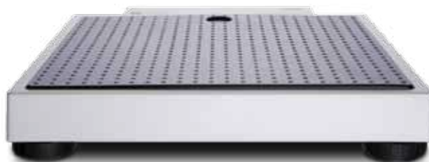
The flat design and slip-proof surface ensure easy access and a secure stance.

Special mention should be made of the double display that lets the patient and medical personnel read the results from two different directions at the same time. Thanks to a protected toggle switch and a manual power switch, which prevents unintended activation during transport, the function of the scale is always ensured even under difficult conditions.