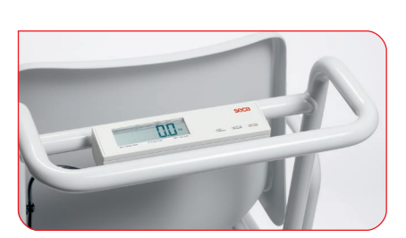
The practically positioned display is easy to use.