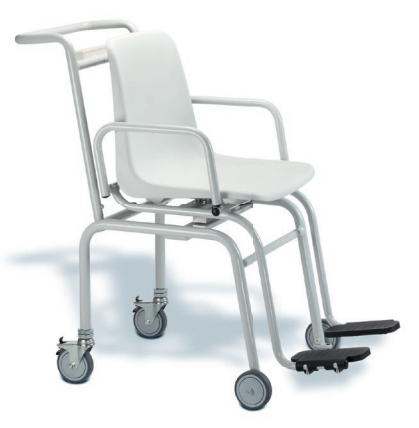
TARE and auto-HOLD.

Thanks to the fold-up armrests and footrests, elderly and heavy patients can take a seat on the scale easily and comfortably. It is just as easy for personnel to use the scale because the batteries eliminate the need for connection to an electrical outlet and keep on working through up to 4000 weighings. No time is lost to a learning curve - a user can operate the scale intuitively. Display elements are conveniently located in the handle and can be set to show kilograms, pounds or stones.