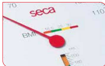
It is easy to determine BMI with the colorcoded dial.